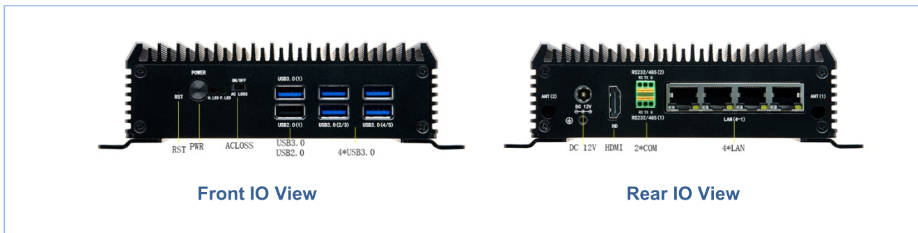
Front IO View