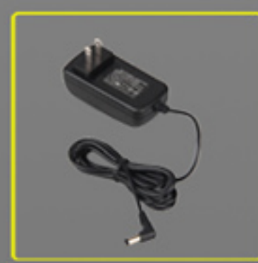
Home Power Adapter