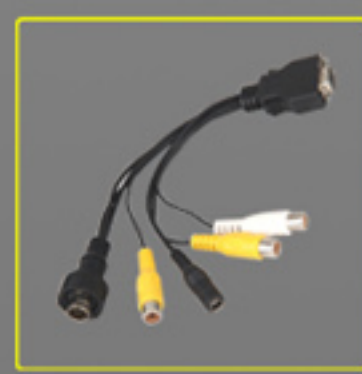
SKS Cord Extend