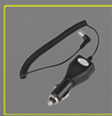
Car Cigar Lighter