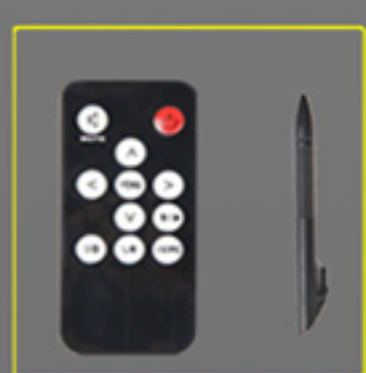
Remote Controller & Touch Pen